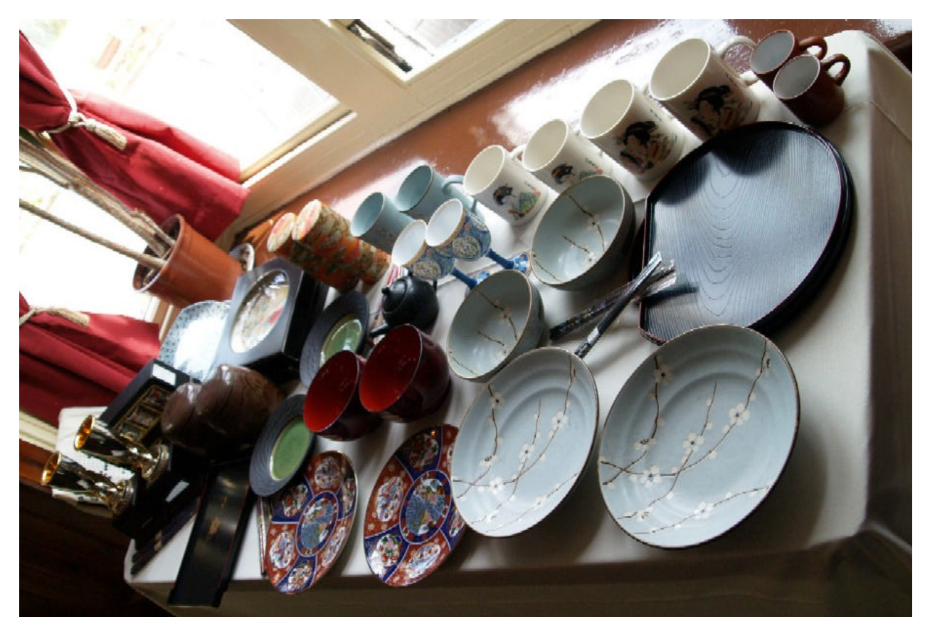
Oriental Bazaar: Pair Go Prizes and Trophies