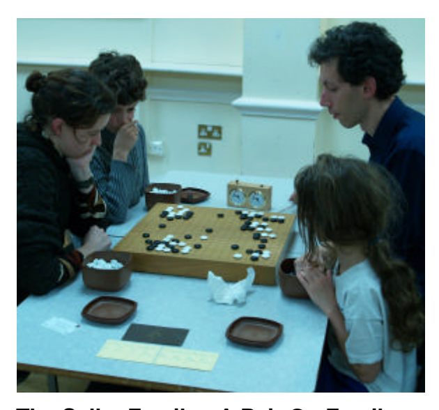
The Selby Family - A Pair Go Family

Results at http://www.britgo.org/results/2013/londonpair.html