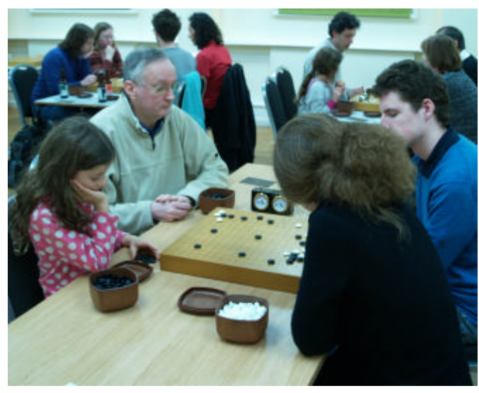
More London Pair Go Action