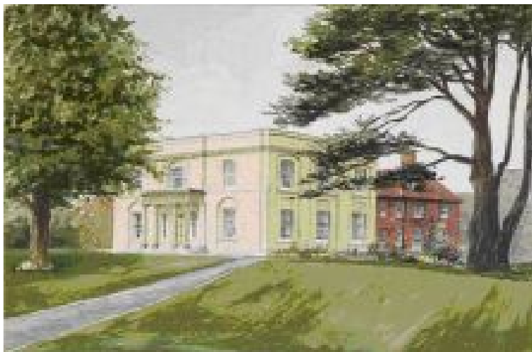
Walton hall. The Hub theatre is behind. Sadly the cedar tree on the right died last year and is now a stump.

At the risk of pandering to your prejudices, here is a roundabout-shaped problem. Status?